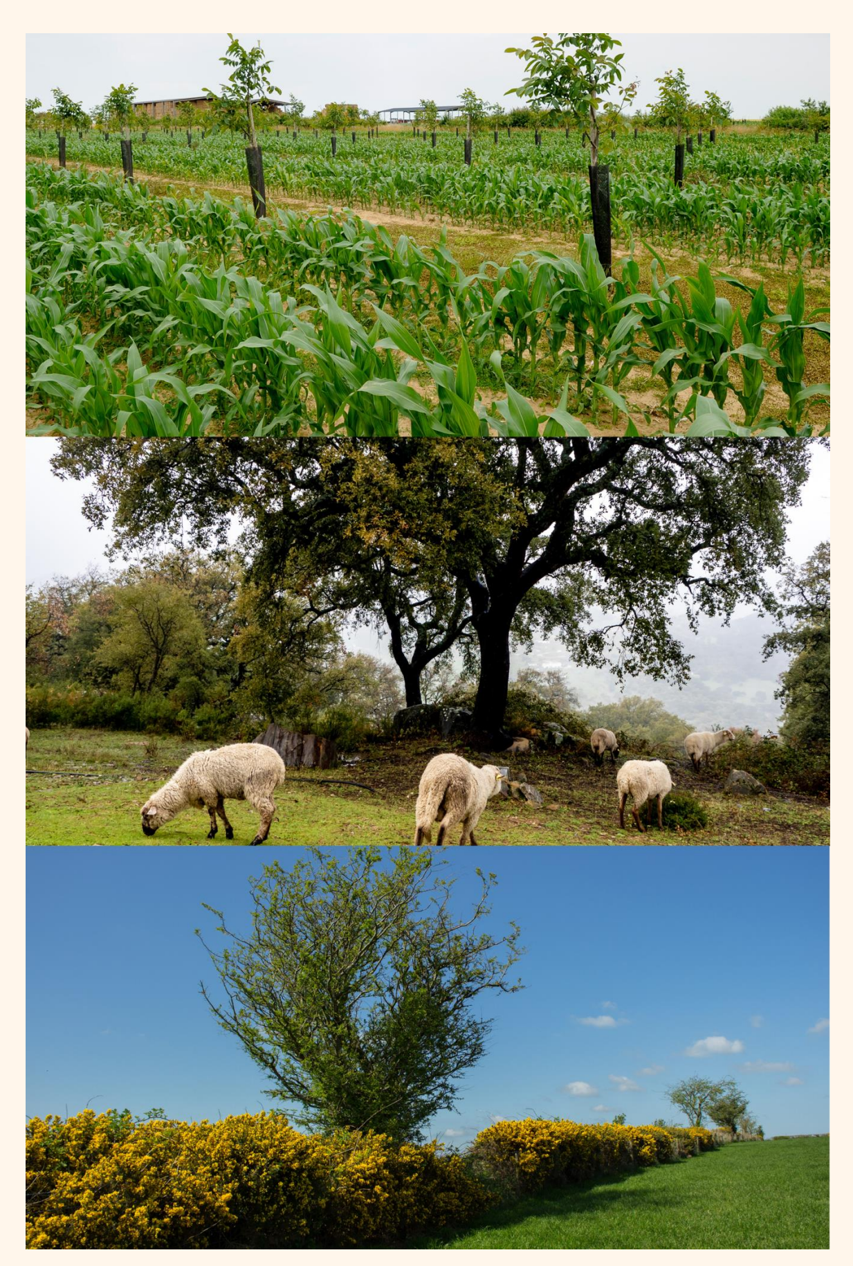
Figure 2: images of various agroforestry systems. Images depict silvoarable, silvopastoral, and hedgerow systems (top to bottom).